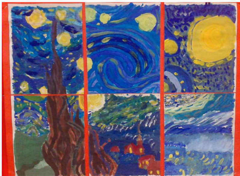
Year 6 pupils' interpretation of a famous Van Gogh painting.

Children study a range of famous art works and are encouraged to comment and express an opinion upon these. We provide the opportunity to learn about the creative arts of different cultures and to explore the meanings and feelings evoked from hands-on and practical experiences.