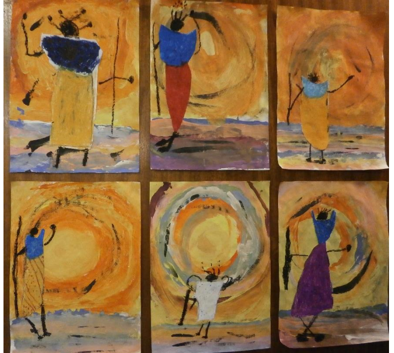
Year 2 art work linked to their topic on Africa.

We provide opportunities for self-expression and a sense of personal achievement, celebrating and displaying pupil's art work throughout school.