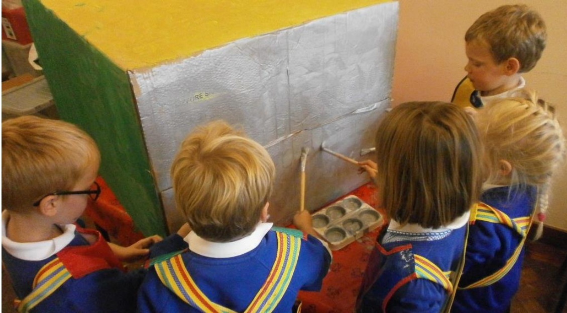
Year 1 pupils mixing colours to create their very own time machine.

We believe that art is about creativity, imagination and exploration of personal expression.