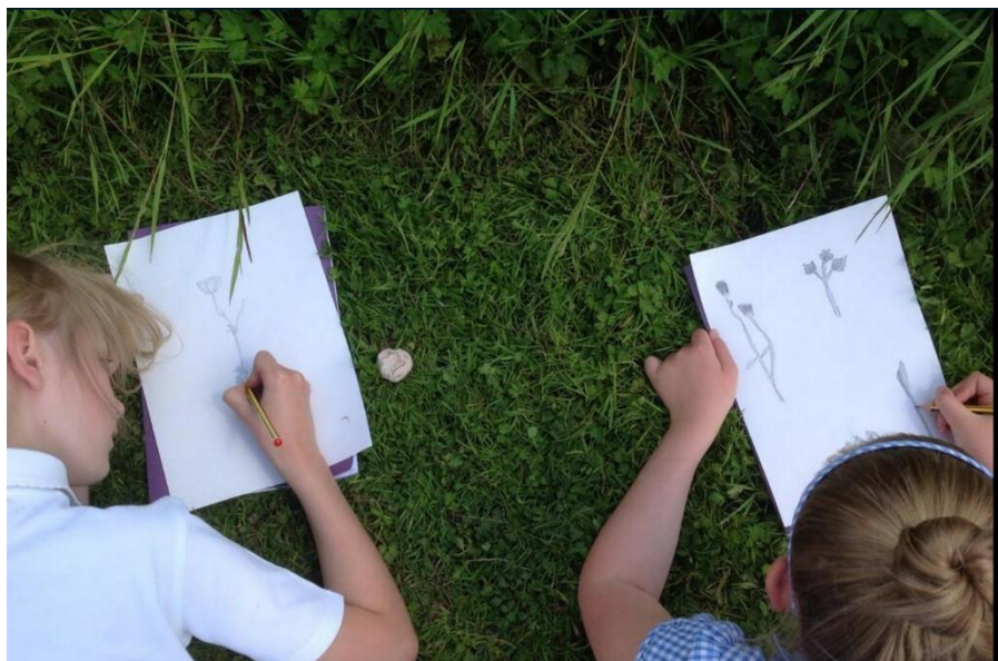
Year 5 children take advantage of the weather.