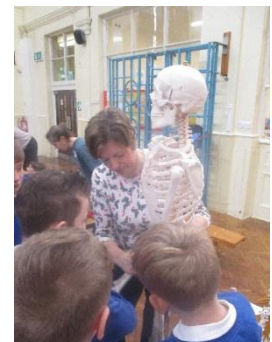
We understand how science is relevant for our futures.