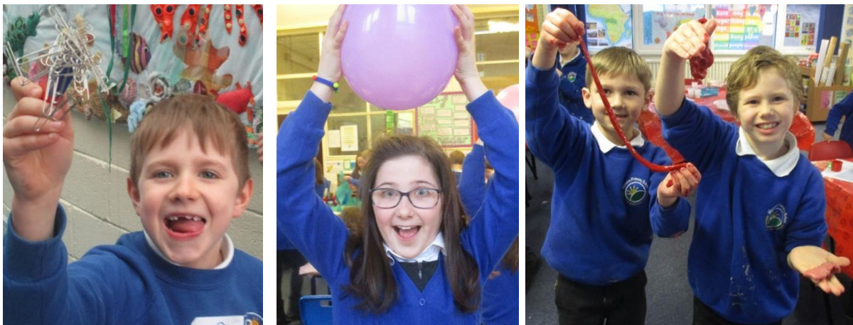
Children love exploring and finding out new things.