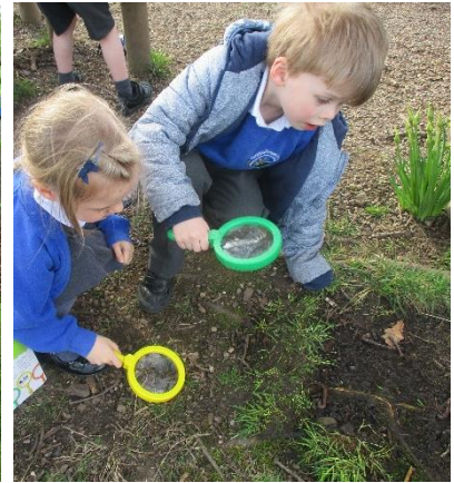
We regularly make use of our wonderful school grounds.