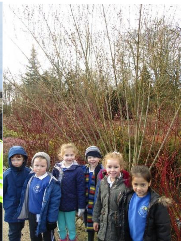
We also explore science in environments beyond our school.