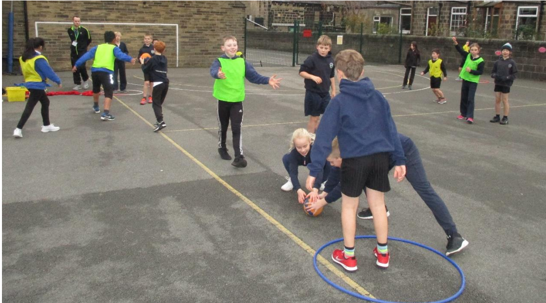
Children enjoying a games lesson

At Menston Primary School we deliver a balanced physical education curriculum. We encourage all the children to: develop an active, healthy lifestyle by greater participation in school sports and competitions; engage in healthy eating and extend their learning in other areas such as maths.