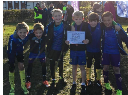
Cross Country Success